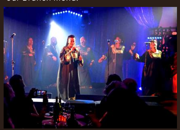
INFO | MENU | RESERVATION lebalcon.ca/gospel-brunch

A weekend getaway in Harlem? No need to go to New York! Come celebrate with us the outpouring of Gospel music with our Brunch menu.